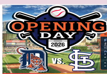
3rd- Tigers Opening Day Play Ball!