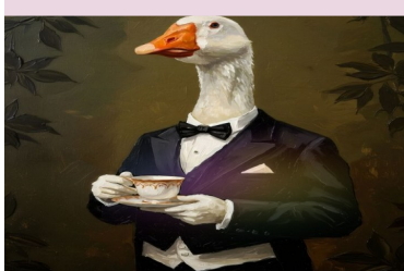
1st -April Fools Day

PORT HURON April 2026 CALENDAR OF EVENTS